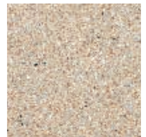
CC212D Welding rod No. R5502-M