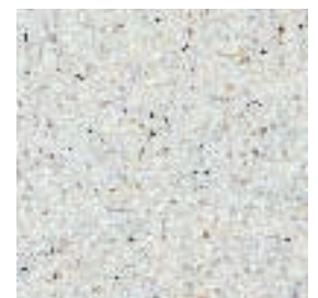
CC212W Welding rod No. 0399-M