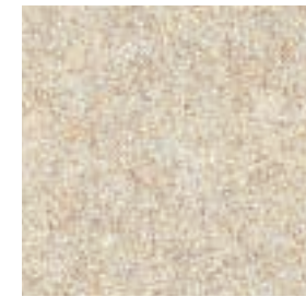
CD179S Welding rod No. R5510-M

Production is not the only stage at which we take the environment into consideration. It is also uppermost in our minds during installation when a large amount of waste material is generated. The waste is collected up and sent to the recycling plant in Ronneby, Sweden.