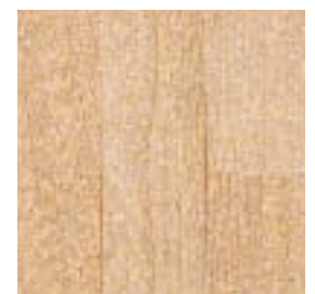
CD217T Welding rod No. R5516-M

Due to the limitations of the printing technology, the floor colours pictured may differ slightly from the actual colours. We reserve the right to make any changes.