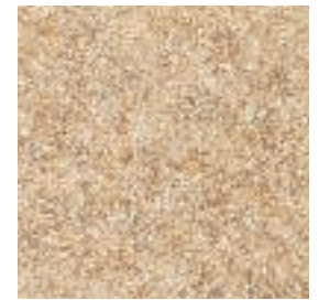
CD179T Welding rod No. R5511-M