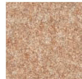
CD179D Welding rod No. R5512-M